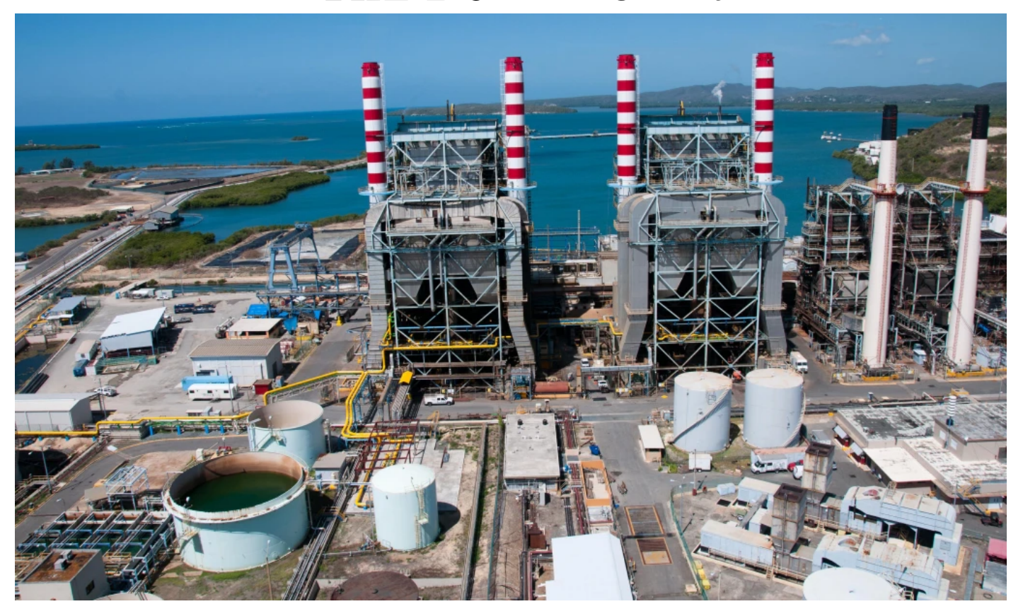
Some observers say the First Circuit Court of Appeals is likely to overturn the lower court's lien ruling, forcing the renegotiation of the PREPA plan.

Meanwhile, the First Circuit Court of Appeals is likely <u>to reverse rulings underlying the PREPA plan</u> of adjustment, forcing its substantial alteration, according to two observers.